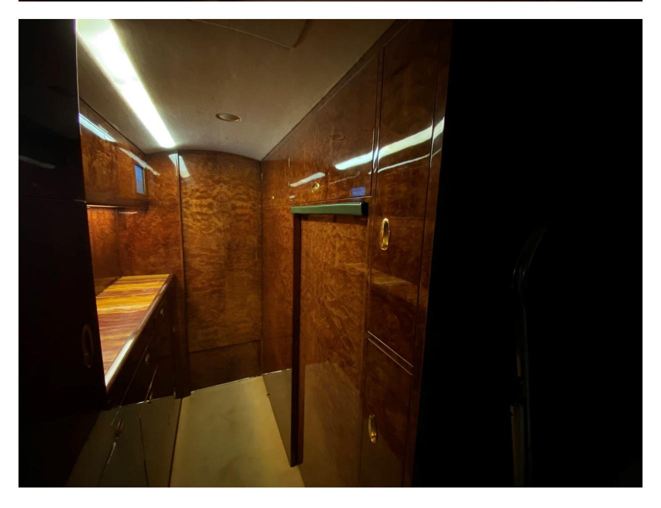
All Specifications subject to verification upon inspection. Aircraft availability subject to prior sale or removal from the market.