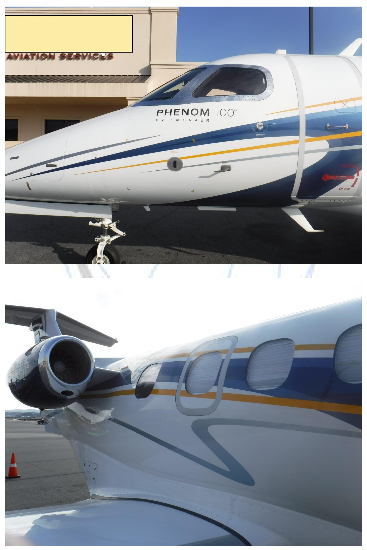
Specifications subject to verification by buyer. Aircraft subject to removal from market without notice.