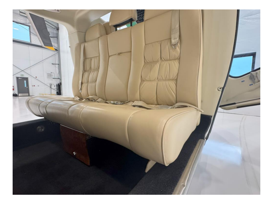
Specifications subject to verification by Buyer, Seller does not warrant. Aircraft is subject to removal from the market without notification