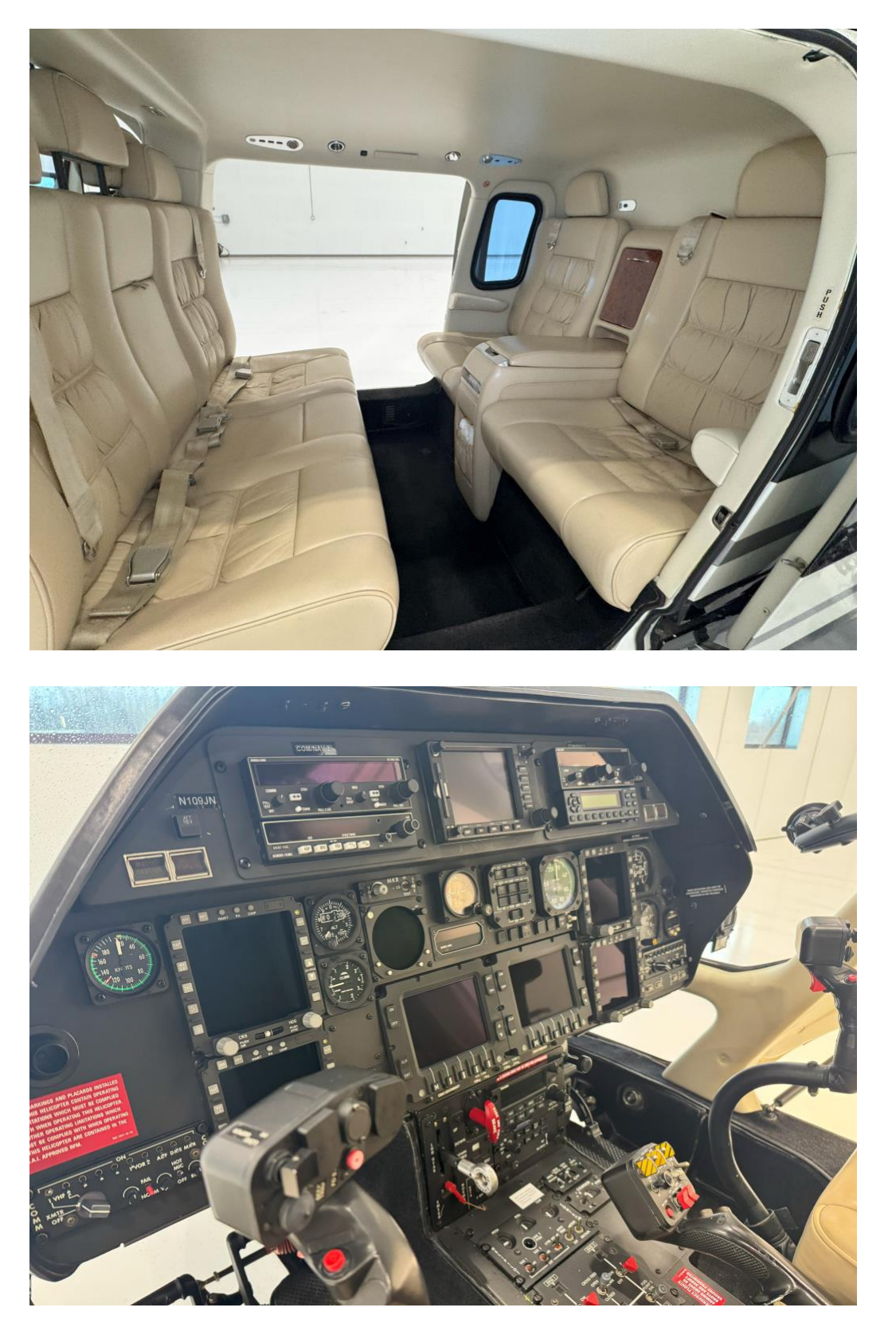
Specifications subject to verification by Buyer, Seller does not warrant. Aircraft is subject to removal from the market without notification

(425) 985-0155 www.GreatCircleAircraft.com